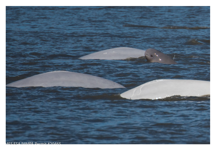
Figure 1. Cook Inlet beluga whale count.

Average water depth in the location of the leak is roughly 80 feet. Seasonal ice flows in inlet waters made diving unsafe, so authorities had to closely monitor the situation until conditions allowed divers to repair the leak.