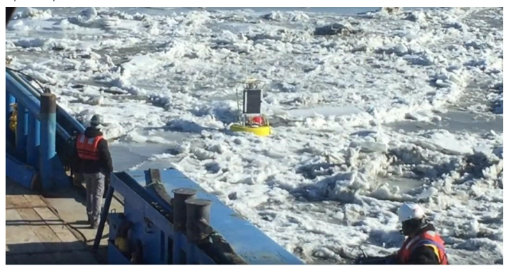
Figure 4. Aridea buoy-based monitoring system with Aqua TROLL 600.

"One of the big reasons we chose the Aqua TROLL 600 is because of its self-cleaning function," says Evans. "With its enclosure, we also knew that it would stand up to conditions, even if it started icing. Finally, we knew if we had challenges with the instruments that In-Situ would back us up with service and spare parts."