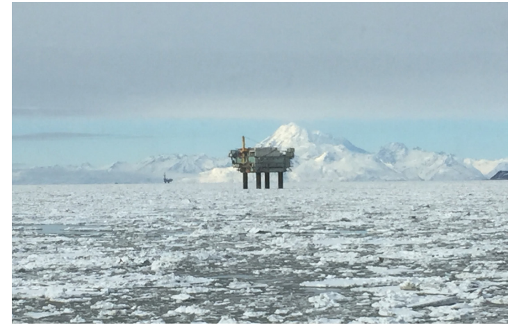
Figure 3. Cook Inlet drilling rig.

And there was one other crucial challenge: timing. Normally, Evans says, build time for this type of project would be about 8 to 12 weeks. In this case, the customer needed Aridea to have the system ready in just 10 days.