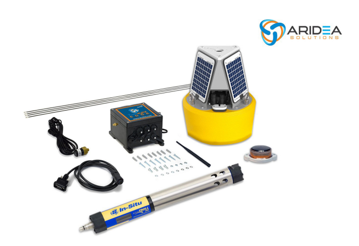
Figure 5. Aridea Offshore buoy kit with Aqua TROLL Multiparameter Sonde.

Evans says nothing like this had been built before, so it wasn't known how the system would perform, even as they arrived on site to deploy it.