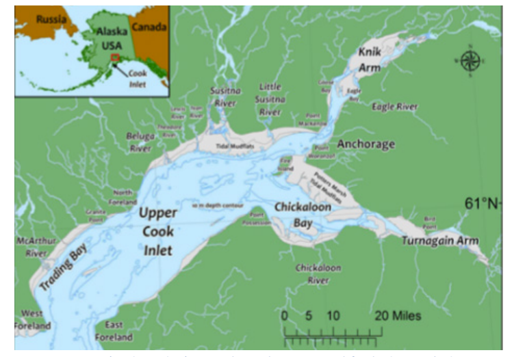
Figure 2. Cook Inlet, Alaska, is a breeding ground for beluga whales.

A huge concern was that the area is one of the world's only breeding grounds for beluga whales and is designated as critical habitat for this endangered species. High methane concentrations increase the risk of respiratory and other health problems in whales, and the presence of methane combined with the leak's acoustic pollution could even drive them from the area.