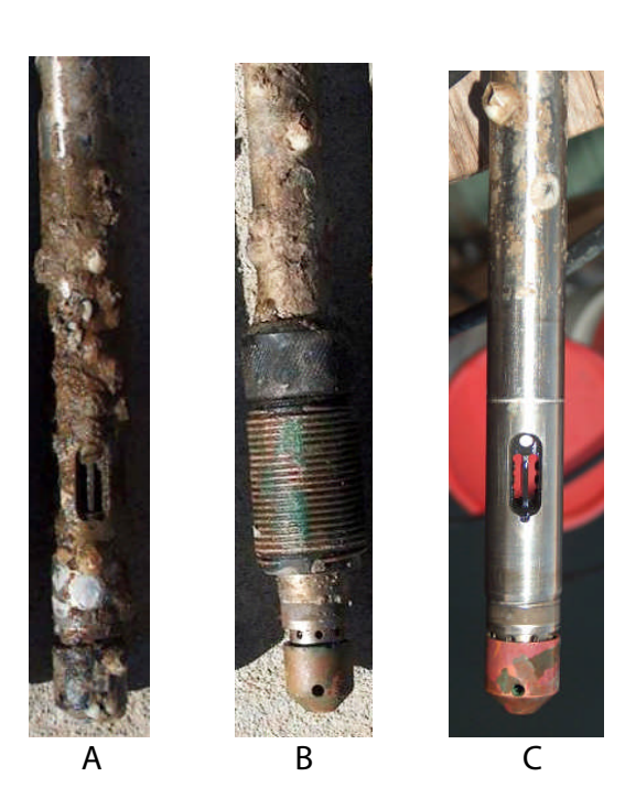
Figure 3: Three instruments after 81-day test. Photo A : Aqua TROLL® 200 control. Photo B : Aqua TROLL 200 with TROLL® Shield guard and nose cone still installed. Photo C : Aqua TROLL 200 with TROLL Shield nose cone in place and guard removed to show how effectively the guard protects the conductivity cell from biofouling. The conductivity cell was not cleaned.