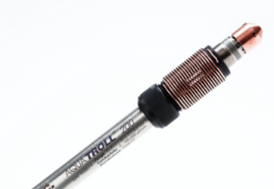
Figure 1: Aqua TROLL 200 Instrument with complete TROLL Shield Antifouling System

Accuracy of level data was not evaluated in this report; however the TROLL Shield nose cone did provide visible protection to the instrument's pressure sensor.