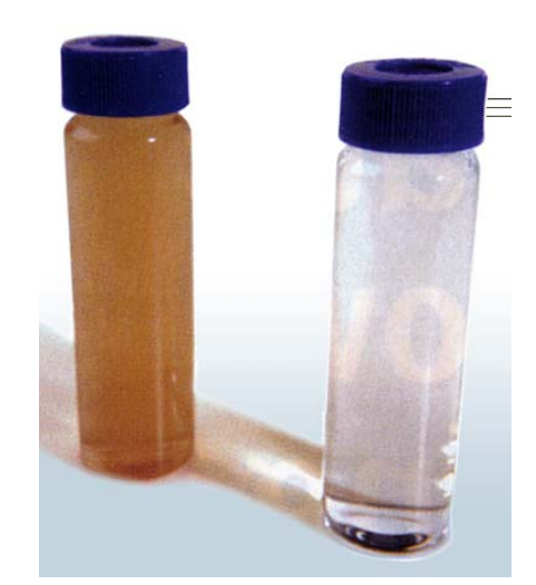
Figure 1. Common problems encountered in ground water sampling can lead to samples that don't reflect the true chemistry of the water.

In the first approach, selected water quality parameters such as pH, conductivity, and dissolved oxygen are monitored during low-rate purging, with stabilization of these parameters indicating when the discharge water represents aquifer water (Barcelona et al. 1994). In the second approach, data resulting from low-flow samples is compared to data from conventional fixed-volume purging, with comparable data verifying the equivalency of the two methods (Powell and Puls 1993; Shanklin et al. 1993; Kearl et al. 1994).