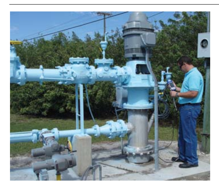
Lee County Utilities (LCU) in southwest Florida is pioneering an ambitious Aquifer Storage and Recovery program. LCU will use self-powered Aqua TROLL® 200 Instruments to monitor and communicate well level and specific conductivity measurements by SCADA or cellular telemetry. A RuggedReader® Handheld PC with Win-Situ® Mobile Software allows operators to review and evaluate measurements onsite.

1992; Christensen et al. 1999), which implies a linear relationship between these two parameters.