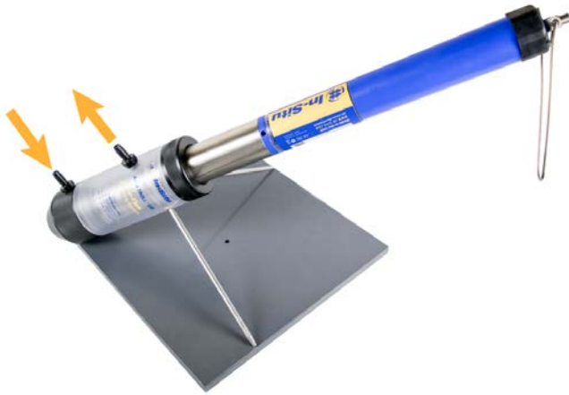
Aqua TROLL 600 Low-Flow Kit

Low-Flow Sampling equipment is used to direct the flow of water past water quality sensors during purging and low-flow sample tests. The seal between the instrument and the flow cell prevents water oxygenation prior to analysis. The 3-way intake valve can be used to divert flow for sample collection. The anti-siphon check valve prevents back flow at the outlet. The system accommodates 3/8" and 1/4" tubing, which is not included.