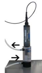
Aqua TROLL 400 Low-Flow Kit