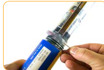
Use Allen wrench to remove and check desiccant color. If pink, replace.