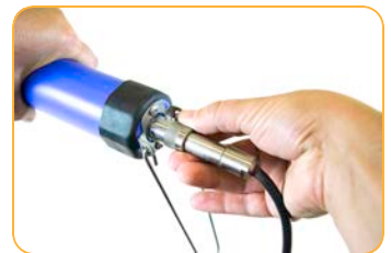
Hold textured sleeve of cable in one hand and instrument in other. Push and twist until click.