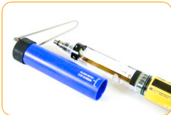
Open battery compartment.