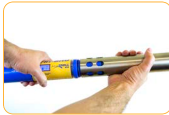
Replace restrictor with vent holes at base of instrument.