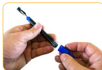
Remove dust cap from wiper motor or motor port plug.