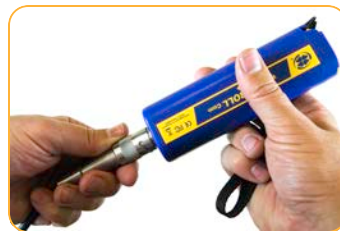
Align TROLL Com connector with cable end. Push and twist until click.