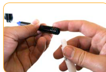
Apply lubricant to O-rings.