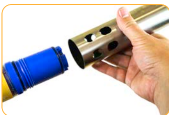
Remove restrictor and protective sticker.