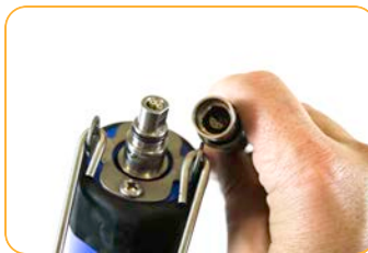
Flat edge inside cable end must align with flat edge on instrument connector.