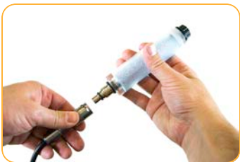
If desiccant is present, remove it from cable.