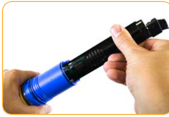
Install sensor in port 1. Sensor tongue must slide into blue interlock groove.