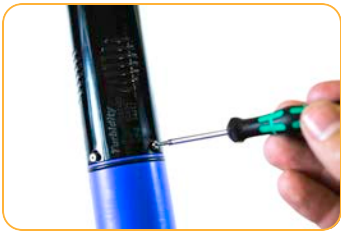
Tighten screw at base of each sensor with Allen wrench.