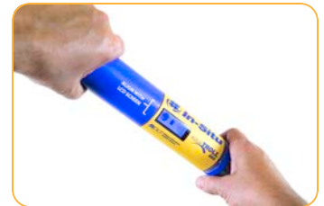
Close battery compartment. LCD screen should activate.