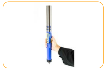
Connect VuSitu directly to instrument. Hold sonde vertically with sensors up. Screen will activate.