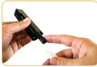
Apply a pea-sized drop of lubricant to O-rings.