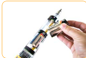
Install alkaline batteries.