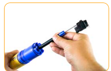
Insert motor/port plug into center port.