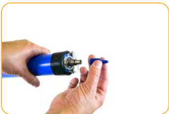
Remove protective caps from instrument and cable.