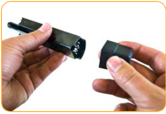
Remove dust cap from pH/ORP sensor.