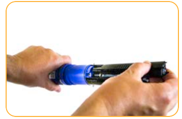
Install remaining sensors.