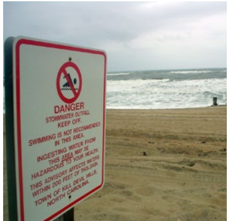
Figure 2. Beach closures in North Carolina impact local economies. Collecting accurate water level and water quality data help scientists understand patterns of pollution delivery.

Upstream of each outfall, researchers are collecting water level data using Level TROLL® 500 Instruments. Information collected at these sites helps researchers understand the most likely source of the flow for a particular stormwater event. Doppler flow